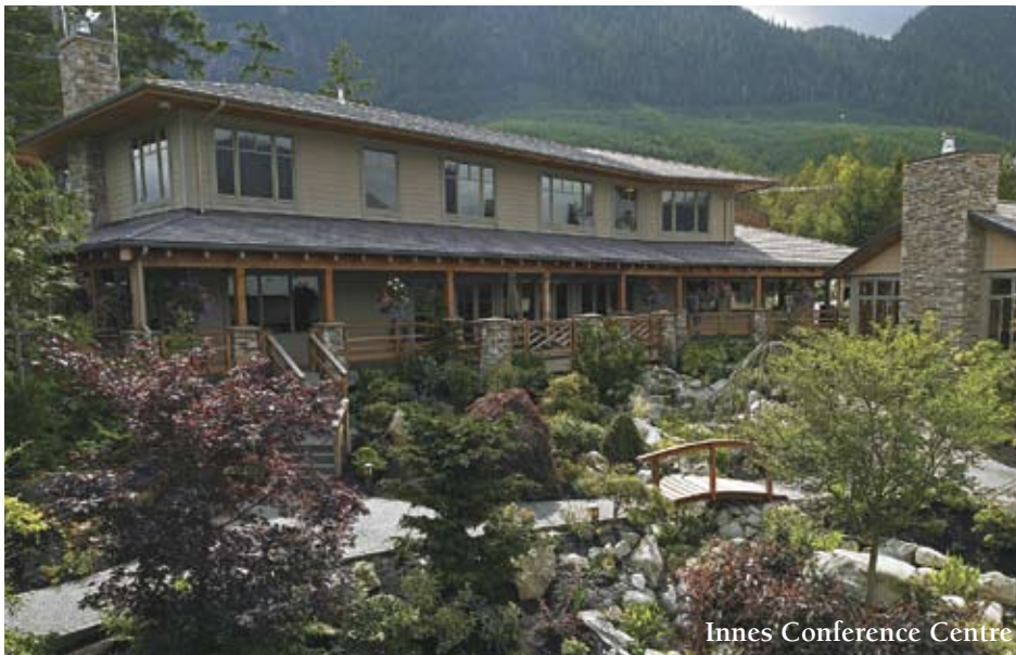
Innes Conference Centre

Successful businesses rely on key people staying focused, planning strategically for the year ahead. Sonora Resort offers the perfect environment for envisioning your company's successes, as our location itself will naturally inspire you.